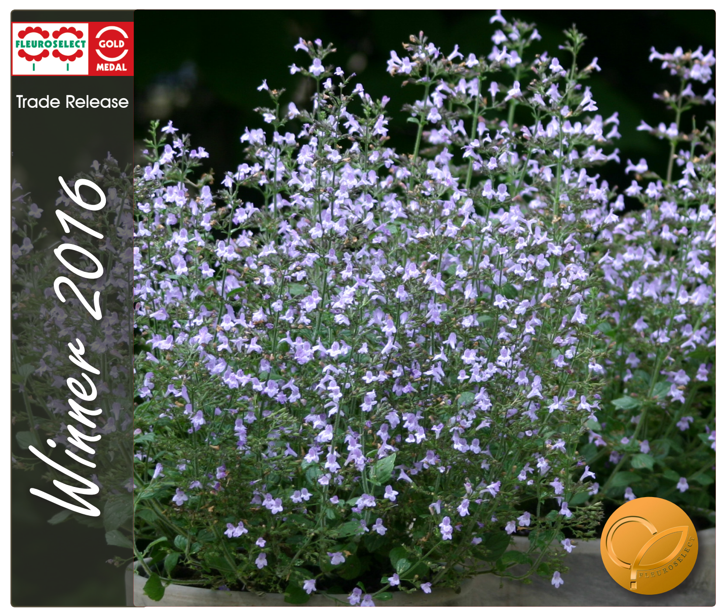
Marvelette Blue, a bee-friendly marvel for the patio and garden.

A marvellous, blue bee attraction, that's what this Planted compact Calamintha from seed will create in the colour and fragrance to the patio. garden! Its large, striking, purple-blue flowers are produced in profusion on upright spikes above the foliage. This first-year flowering perennial flowers within 12 weeks from a spring sowing and will bring blue to the garden all summer long. The sweet, mint smell of the fresh, mid-green foliage attracts butterflies and bees. This outstanding garden performer makes a great filler in sunny borders, but can also be used as a superb edging for walks.